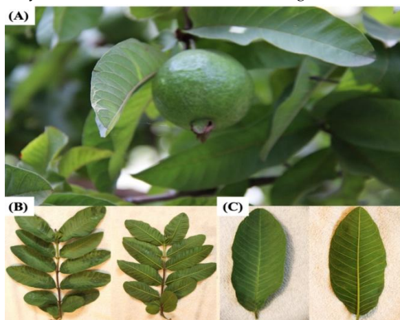
Fig 1. (A) Guava fruit and leaves, (B) Bunch of guava leaves with dorsal view on the left and ventral view on the right, (C) Guava leaf with dorsal view on the left and ventral view on the right.

conditions as well as to boost platelets in dengue fever patients [3]. The antispasmodic, cough sedative, anti-inflammatory, anti-diarrheic, anti-hypertension, anti-obesity, and antidiabetic effects of GLs (Guava leaves) are also commonly utilized [4]. Studies using animal models have confirmed the effectiveness of GL isolates as cytotoxic, antitumor, and anticancer agents [5, 6].