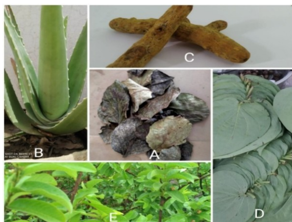
Fig. A-Dry Indian cherry leaves, B- Aloe vera, C- Turmeric, D- Betal (paan) leaves and E- Guava leaves