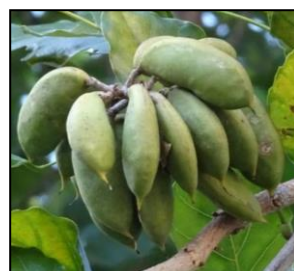
Fig. 5: Pods