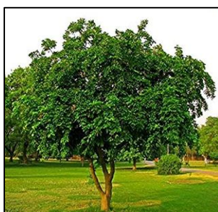
Fig. 1: P. pinnata tree

Flowering usually begins at 3–4 years, with little bunches of white, purple, or pink flowers [Fig. 4] which bloom throughout the year. The raceme-like inflorescences produce two to four fragrant flowers that measure 15–18 mm [0.59–0.71 in] in length. The flowers' calyx is truncated and bell-shaped, while the corolla has a rounded oval form having basal auricles and a green splotch in the center. The seeds [Fig. 6] of Pongamia pinnata are elliptical in shape and covered with a hard shell [Fig. 5] that appears brown in color at the time of maturity. An average weight of P. pinnata seed is 3.18g and its thickness varying form thickness from 5.00-10.00mm [7].