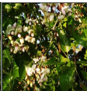
Fig. 4: Flower