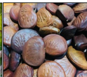
Fig. 6: Seeds