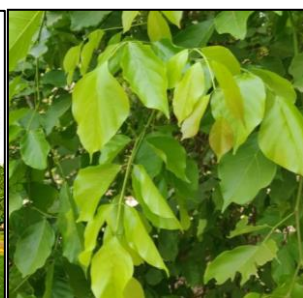
Fig. 2: Leaves