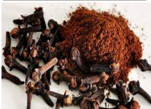
Fig 01: Eugenia aromatica